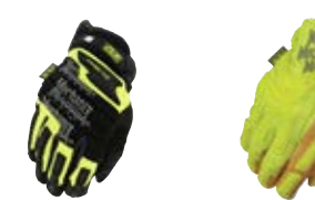
M-PACT® 2 SP2-91 CG HEAVY DUTY CG40-91