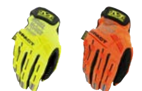
M-PACT® E5 SMP-91 M-PACT® E5 SMP-99