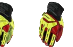
M-PACT® XPLOR™ HIGH DEX MPDX-91 M-PACT® XPLOR™ GRIP MPGR-91 M-PACT® XPLOR™ D4 MPCR-91