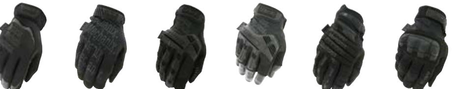
FASTFIT® FFTAB-55 ORIGINAL® MG-55 M-PACT® MPT-55 M-PACT® FINGERLESS MFL-55 M-PACT®2 MP2-55 M-PACT®3 MP3-55