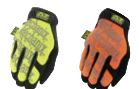
ORIGINAL® XD SMG-91 ORIGINAL® XD SMG-99