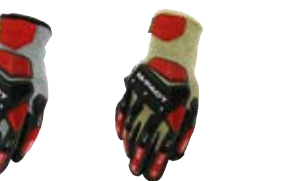
M-PACT® KNIT CR5A5 KHD-CR M-PACT® FR KNIT CR5A5 KHD-FR