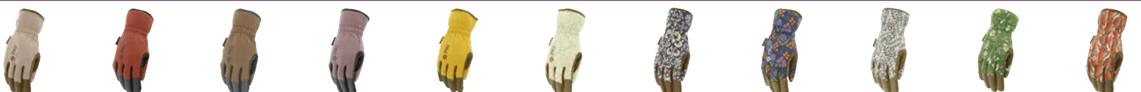
BLUSH ETH-BLH CRIMSON ETH-CRM COCOA ETH-CWG PLUM ETH-PLM SAFFRON ETH-SAF RENDEZVOUS ETH-RND JUBILEE ETH-JBL VEGA BLOOM ETH-VAB VEGA MEADOW ETH-VAE VEGA SWEET PEA ETH-VASP VEGA TULIP ETH-VAT