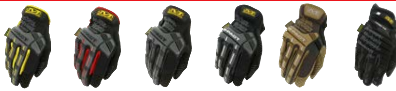
MPT-01 MPT-52 MPT-58 M-PACT® OPEN CUFF MPC-58 M-PACT® MPC-07 M-PACT®2 MP2-05