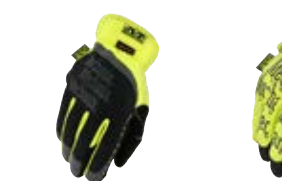
FASTFIT® E5 SFF-C91 ORIGINAL® E5 SMG-C91