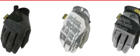
GRIP MSG-05 VENT MSV-00 0.5mm MSD-05