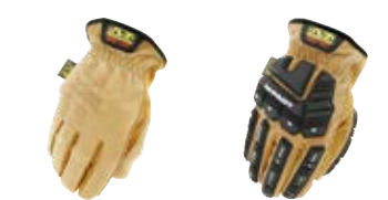
LEATHER DRIVER 360 F9 LD-C75 LEATHER M-PACT® DRIVER 360 F9 LDMP-C75