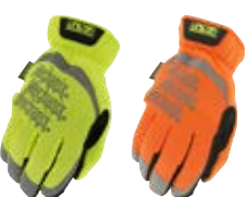
FASTFIT® SFF-91 FASTFIT® SFF-99