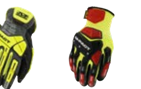
M-PACT® E5 OPEN CUFF SMC-C91 M-PACT® KNIT CR3A3 KHD-GP