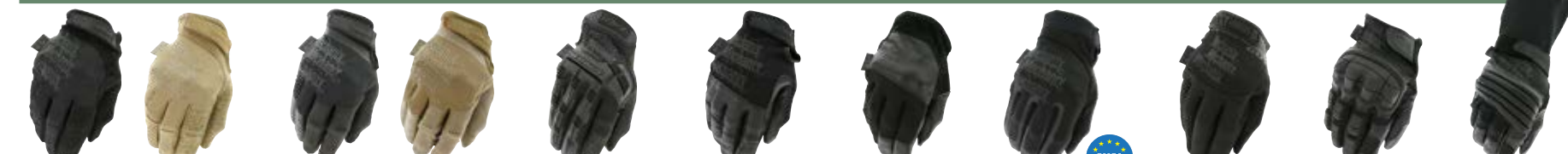
SPECIALTY VENT MSV-55 SPECIALTY VENT MSV-72 SPECIALTY 0.5 mm MSD-55 SPECIALTY 0.5 mm MSD-72 0.5 mm M-PACT® MPSD-55 RECON TSRE-55 TEMPEST TSTM-55 ELEMENT TSEL-55 PURSUIT E5 TSCR-55 BREACHER TSBR-55 AZIMUTH TSAZ-55