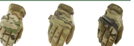
FASTFIT® FFTAB-78 ORIGINAL® MG-78 M-PACT® MPT-78