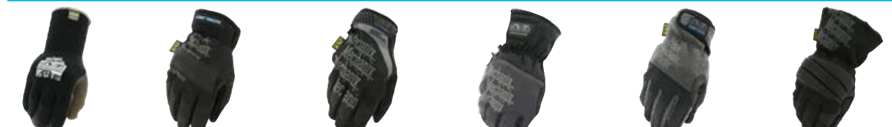
THERMAL KNIT MCW-KD INSULATED FASTFIT® MFF-95 INSULATED ORIGINAL® MG-95 WINTER FLEECE CWWF-08 WIND RESISTANT MCW-WR WINTER IMPACT MCW-WI