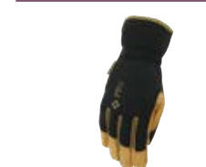
GARDEN LEATHER ETH-GLTH