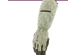
GARDEN ROSE ETH-RSE