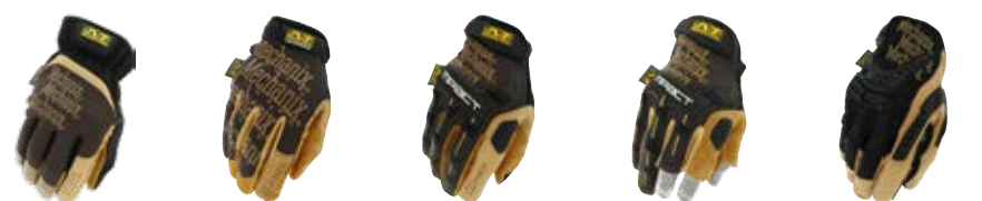
FASTFIT® LEATHER LFF-75 ORIGINAL® LEATHER LMG-75 M-PACT® LEATHER LMP-75 FRAMER LEATHER LFR-75 CG HEAVY DUTY CG40-75