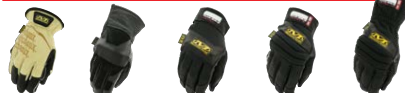
HEAT RESISTANT HRL-05 FABRICATOR MFG-05 CARBONX® LEVEL 1 CXG-L1 CARBONX® LEVEL 5 CXG-L5 CARBONX® LEVEL 10 CXG-L10