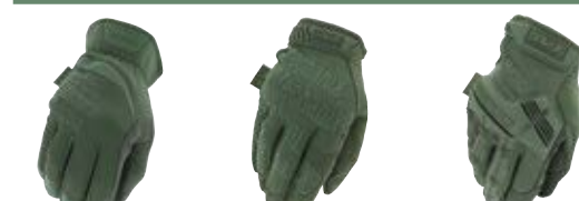
FASTFIT® FFTAB-60 ORIGINAL® MG-60 M-PACT® MPT-60