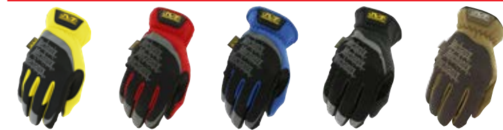
MFF-01 MFF-02 MFF-03 MFF-05 MFF-07