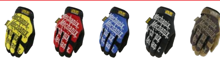
MG-01 MG-02 MG-03 MG-05 MG-07