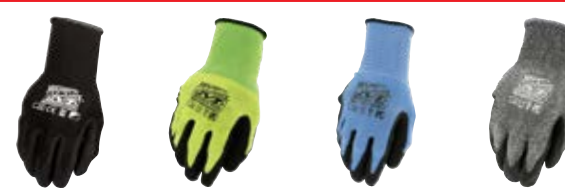
ALL PURPOSE SIDE-05 HI-VIZ SIDE-91 COOLMAX® S1C8-03 CUT S2DE-58