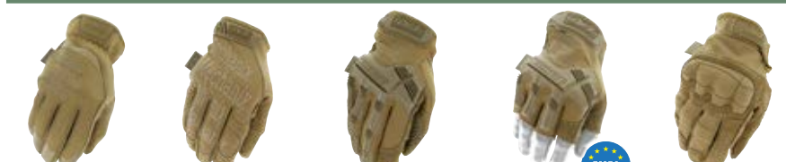
FASTFIT® FFTAB-72 ORIGINAL® MG-72 M-PACT® MPT-72 M-PACT® FINGERLESS MFL-72 M-PACT®3 MP3-72