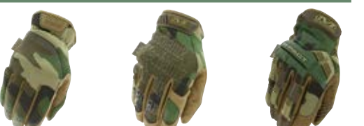
FASTFIT® FFTAB-77 ORIGINAL® MG-77 M-PACT® MPT-77