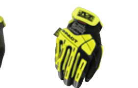
M-PACT® E5 SMP-C91