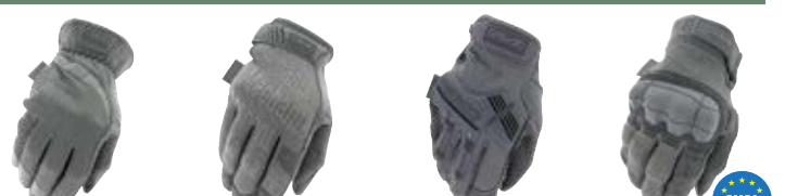
FASTFIT® FFTAB-88 ORIGINAL® MG-88 M-PACT® MPT-88 M-PACT®3 MP3-88