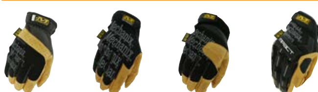
FASTFIT® MF4X-75 ORIGINAL® M64X-75 PADDED PALM PP4X-75 M-PACT® MP4X-75