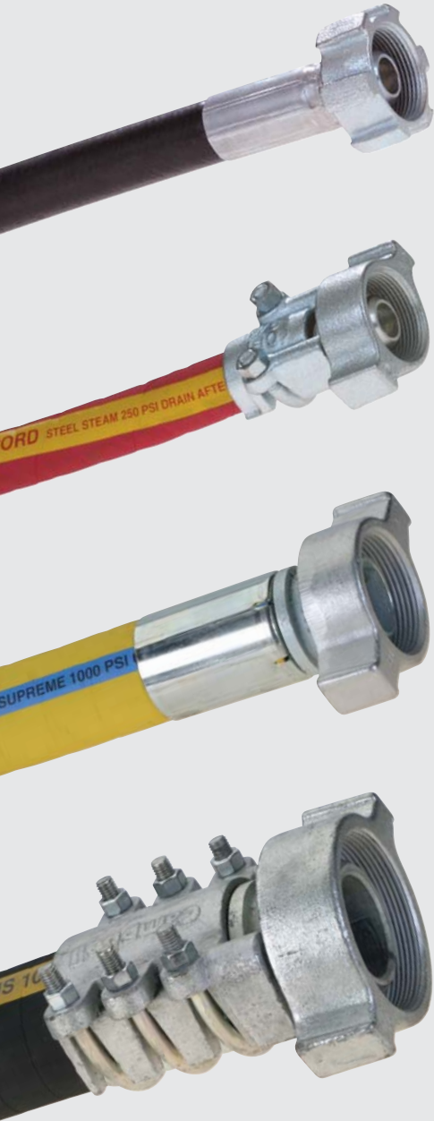
Smooth End Detail

CampbellCrimpnology™ offers hose assembly systems for your high-pressure steam and air applications