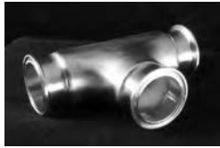
ACQQT 3-way QuickClamp Tee 2" & 3" Stainless Steel construction