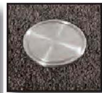
ACQCap - Cap