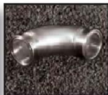
ACQQEFF - 90° Full-Flow Flange