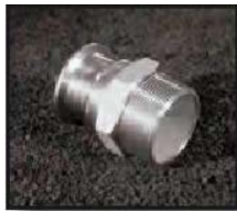
ACQM - Hex Male

QuickClamp accessory items feature a stainless steel construction ensuring compatibility with the widest range of fuels including gasoline, gasoline-ethanol blends, ethanol, diesel, and biofuels.