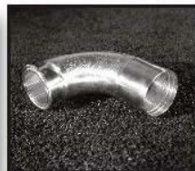
ACQGE - 90° Female Glue Pipe