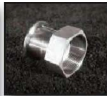
ACQF - Hex Female