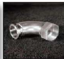
ACQFE - 90° Female