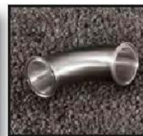
ACQQE - 90° Flange