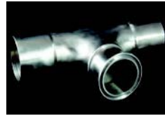
ACQGT QuickClamp by Female Glue Pipe Tee (accessory only) 2" & 3" Stainless Steel construction

QuickClamp accessory items feature a stainless steel construction ensuring compatibility with the widest range of fuels including gasoline, gasoline-ethanol blends, ethanol, diesel, and biofuels.