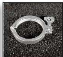
ACQClamp - Clamp