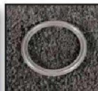
ACQSeal - Seal