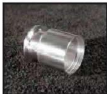
ACQG -Female Glue Pipe