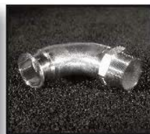
ACQME - 90° Male