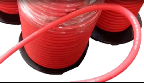
HOSE ON REELS