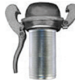
Male Ball x Machine Shank (KC)