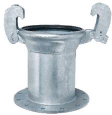
Female Socket x ANSI Flange