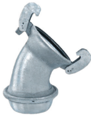
Male Ball x Female Socket 45°