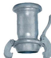
Female Socket x Male Ball Increaser