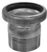
Female Socket x Male NPT