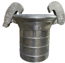
Female Socket x Shank