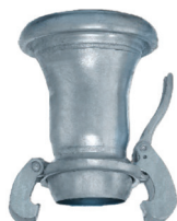
Female Socket x Male Ball Reducer