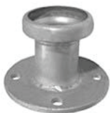
Female Socket x ANSI Flange Reducers