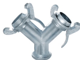
Double Male Ball