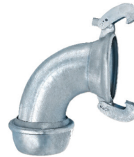
Male Ball x Female Socket 90°