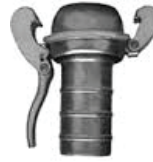
Male Ball x Shank