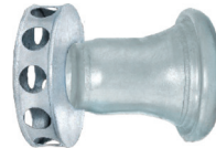
Female Socket x Round Hole Strainer