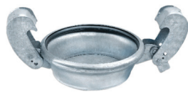
Female End Cap