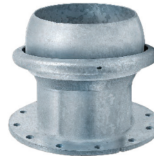
Male Ball x ANSI Flange