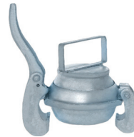
Male End Cap