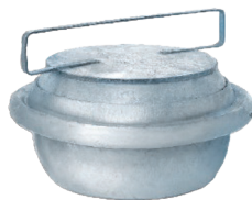
Male End Plug