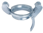
Bauer Locking Lever