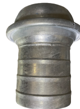
Male Ball x Shank