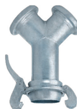
Double Female Socket