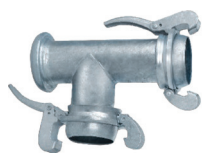
Inline T with Male Branch