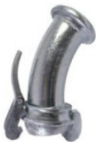
Male Ball x Female Socket 45°