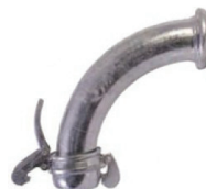
Male Ball x Female Socket 90°