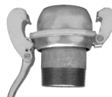
Male Ball x Male NPT