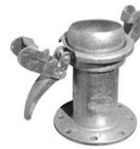
Male Ball x ANSI Flange Reducers