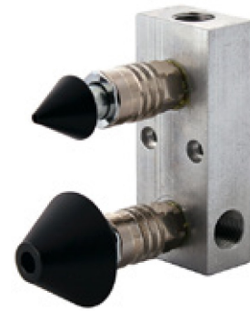
Air Cleaning Systems