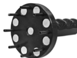
Quick Change Tool