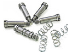
Screws & Springs